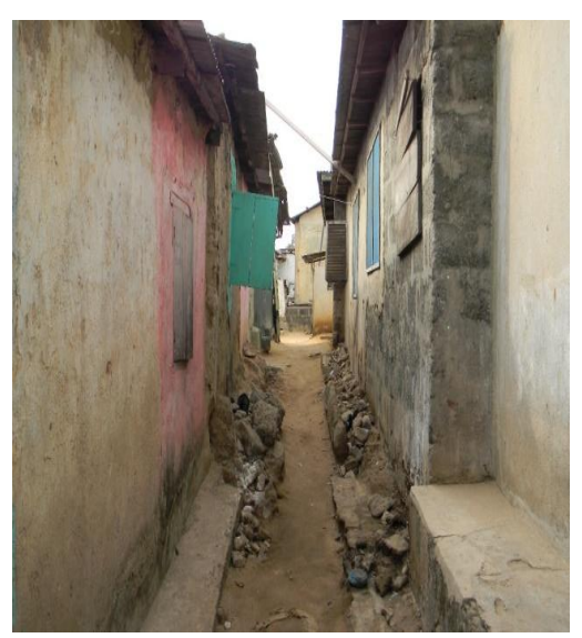
Plate 4: Located at Gyegyem-Enyitsiwdo