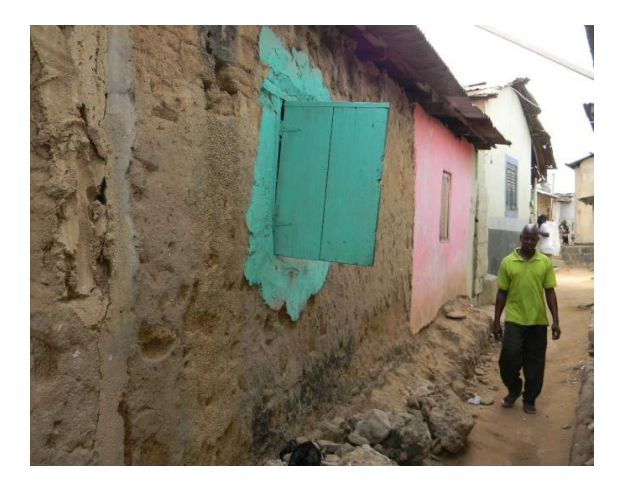
Plate 6: Located at Gyegyem-Enyitsiwdo