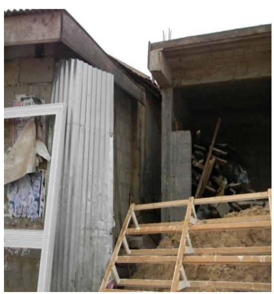
Plate 5: Located at Amanful-Idan