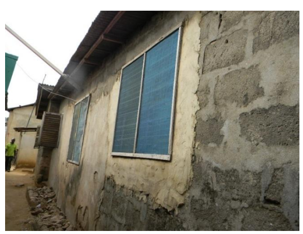
Plate 9: Located at Gyegyem-Envitsiwdo