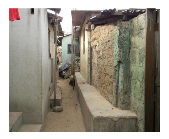
Plates 2 to 9 below show some of the sample buildings in the selected communities.

Well designed and finished residential buildings especially those painted in white and other light colours are found to absorb less heat as compared to those finished in darker and heavier colours.