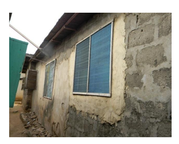
Plate 7: Located at Gyegyem-Enyitsiwdo