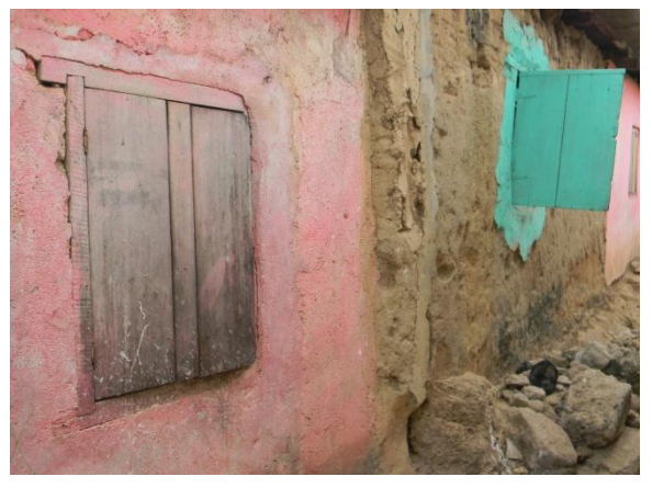
Plate 2: Located at Gyegyem-Enyitsiwdo Plate 3: Located at Gyegyem-Enyitsiwdo