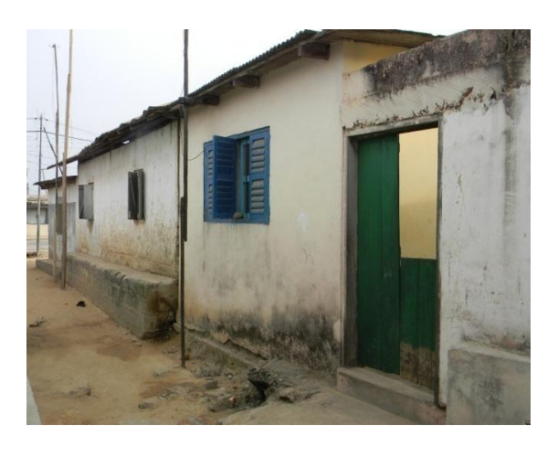
Plate 8: Located at Amanful-Idan